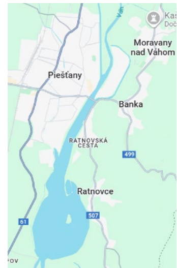
Piešťany - Ratnovce