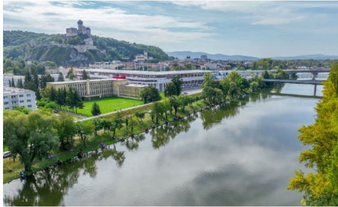
Trenčín castle over the river Váh

Slovakia contains many castles, most of which are in ruins. The best known castles include Bojnice Castle (often used as a filming location), Spiš Castle, (on the UNESCO list), Orava Castle, Bratislava Castle, and the ruins of Devín Castle. Čachtice Castle was once the home of the world's most prolific female serial killer, the 'Bloody Lady', Elizabeth Báthory.